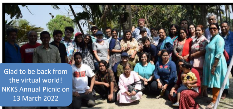
Glad to be back from the virtual world! NKKS Annual Picnic on 13 March 2022

Register by 2 June 2022 Click to register